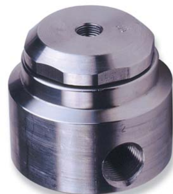
Corrosion Resistant Construction