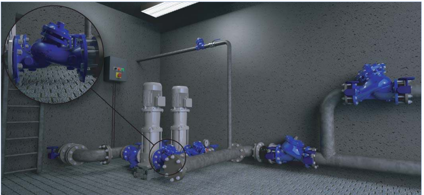
For illustration only