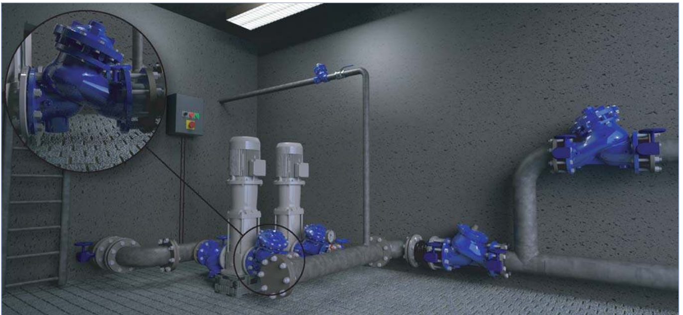
For illustration only