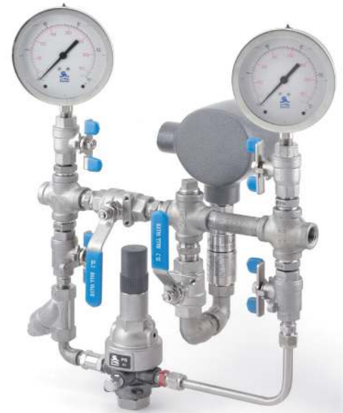
AMD-75 with PSL and PI (see options) (for illustration only)