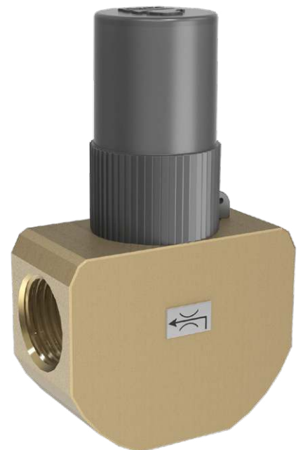
Nickel Aluminum Bronze