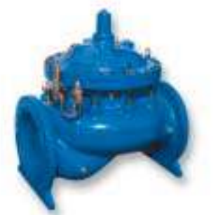
700 - Large Diameter