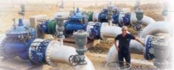
20" industrial reservoir filling system at the entrance to the facility