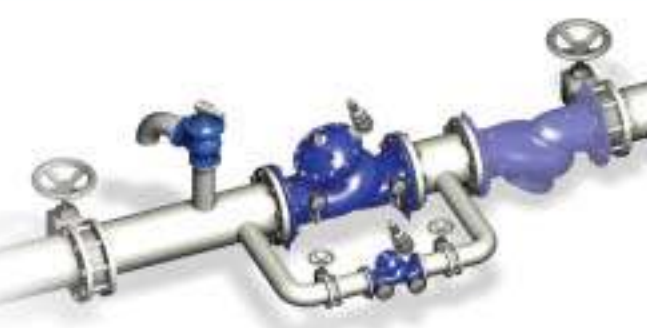
Pressure Reducing Systems

BERMAD has the answer, with its line of specialized water supply system controllers that are electrically operated, either locally or centrally. These include electric or electronic water level control, pumping systems, mixing junctions, filtering and water treatment systems, emergency shut-off or backup systems, pressure reducing systems, and more. Integrating BERMAD Control Solutions with complex applications ensures a broad and comprehensive system solution with full backing and technical support for valves and entire control system.