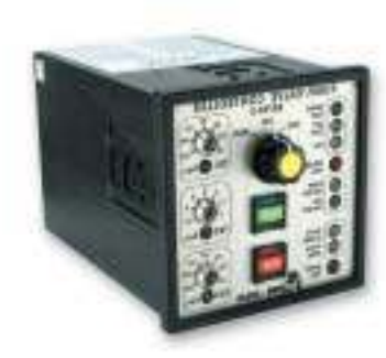
Line of Controllers