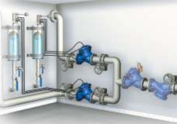
Level Control Systems