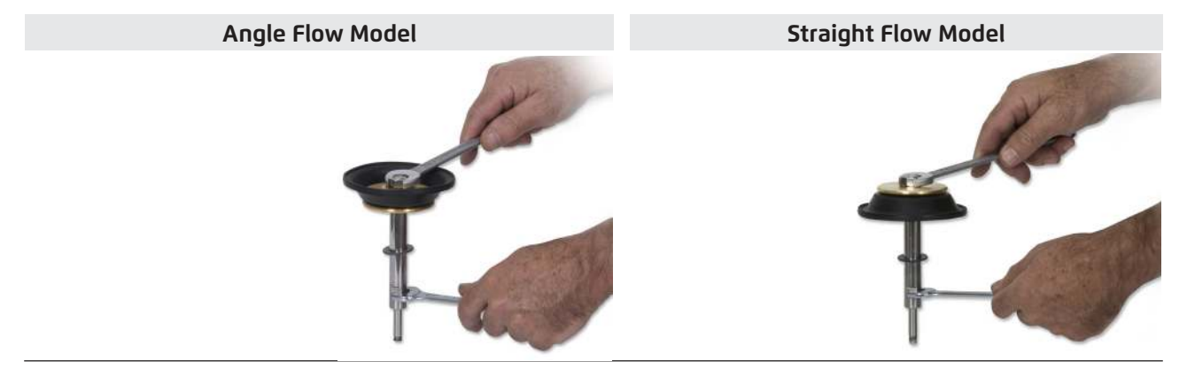
Ε. Remove the diaphragm washer. Check and replace diaphragm as required.

Open the locking nut with the aid of two wrenches - a 9/16 spanner and 13mm spanner.