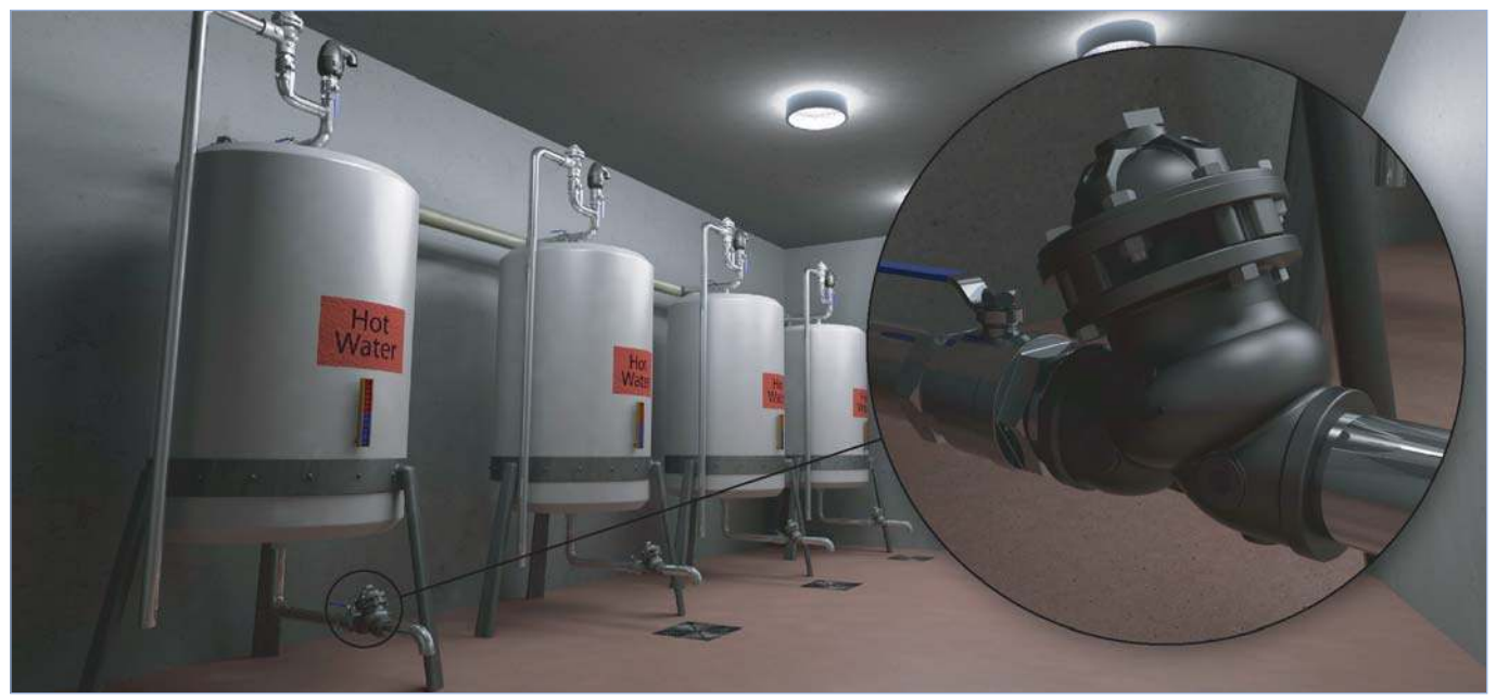
For illustration only