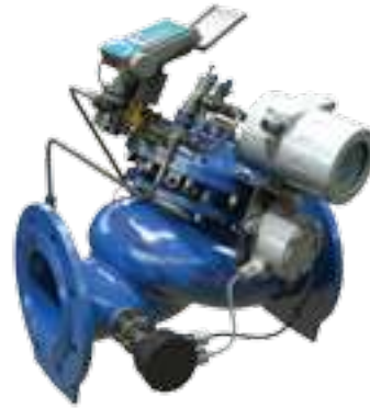
Control Valve with Insertion Flow Meter

One of BERMAD's Pressure Management solutions for optimizing water supply and reducing NRW (Non Revenue Water) - consists of the installation of a two step PRV at the entry point of the DMA (District Metering Area). During low flow demands the PRV is set to low downstream pressure. Due to low water consumption the accumulated head loss is relatively low and the pressure at the farthest consumer point (Critical Point) is almost the same as the pressure setting of the PRV, therefore leakage and bursts are significantly reduced. During high flow demands the PRV is set to high downstream pressure to compensate the relatively high accumulated head loss and maintaining the minimum services level pressure at the CP.