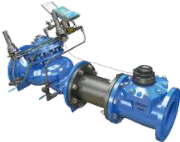
Control Valve with Water Meter