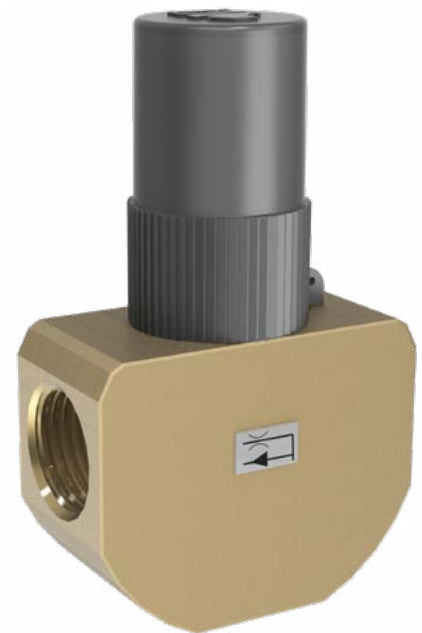
Nickel Aluminum Bronze