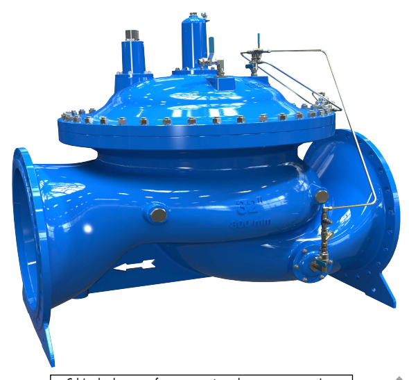
Click here for control accessories

The BERMAD 700 Series large size control valves are hydraulically operated, diaphragm actuated type. Unique hydro-dynamic globe valve design with a special open plug provides high flow capabilities. The valves are available in the standard configuration or with an Independent Check Feature code "25".