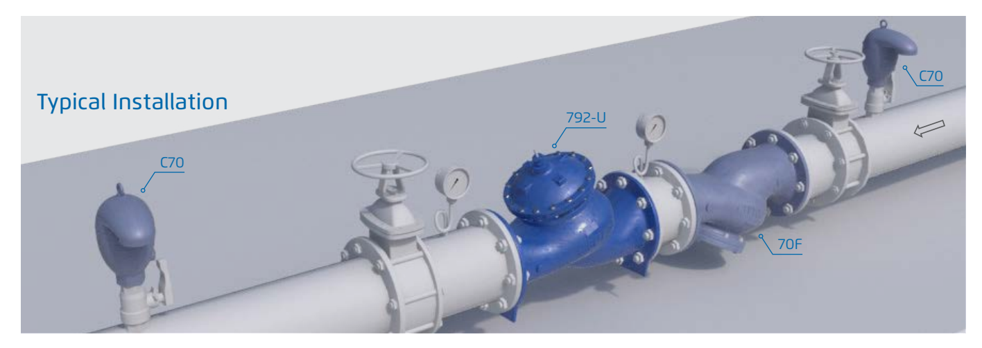
All images in this catalog are for illustration only