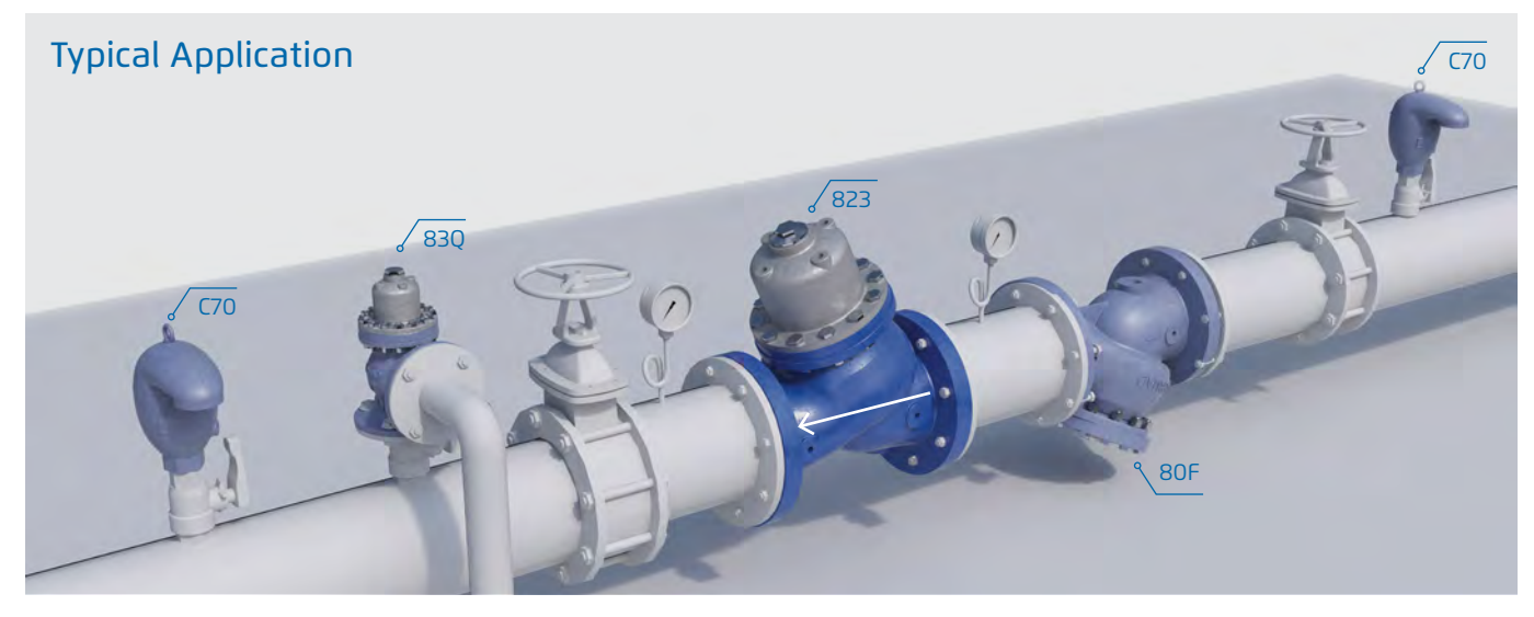
All images in this catalog are for illustration only