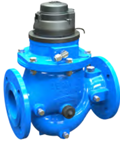
E-Register + 900 Meter

All existing BERMAD water meters with mechanical magnetic registers can be upgraded to the Electronic Register