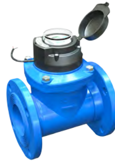
E-Register + Turbo-Bar Meter