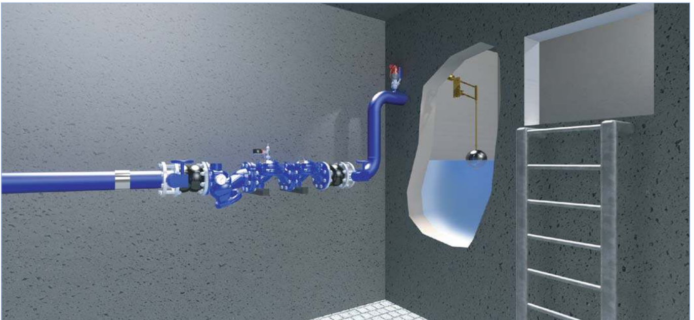
For illustration only