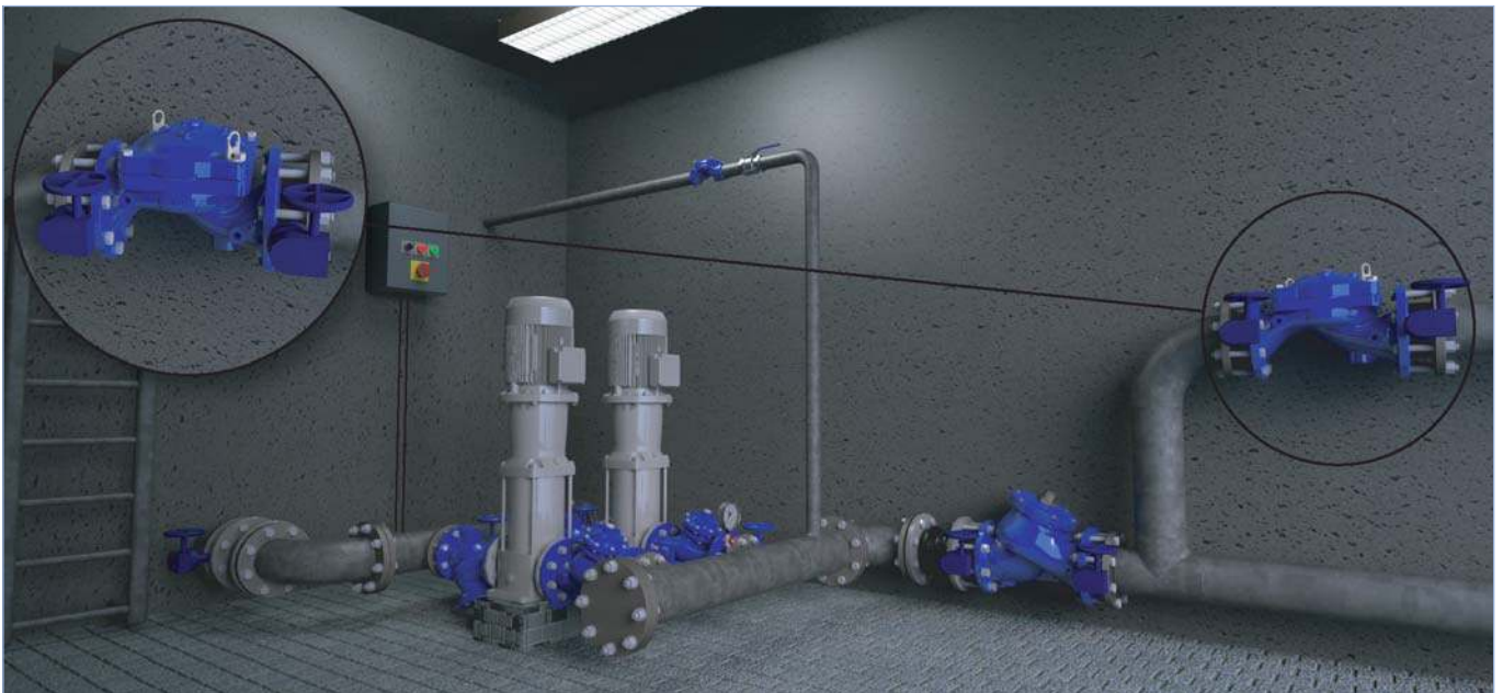
For illustration only