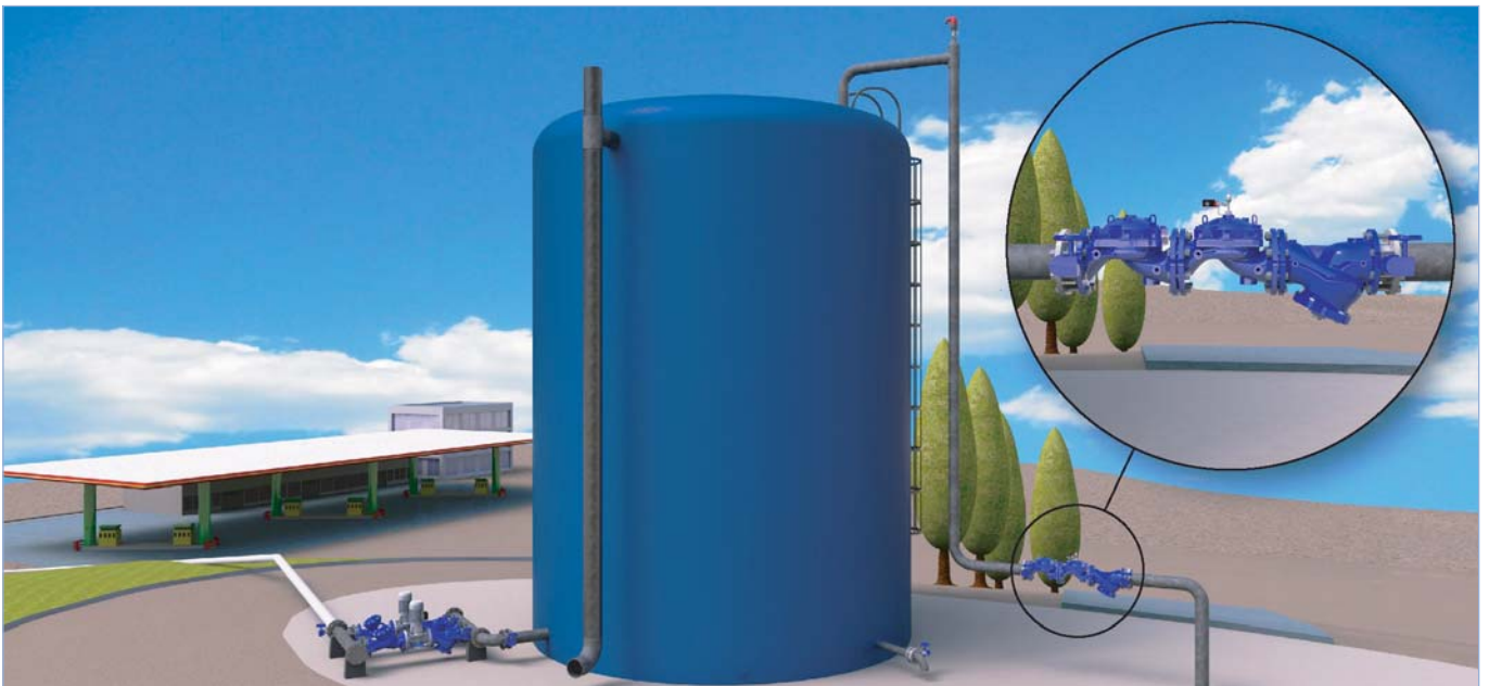
For illustration only