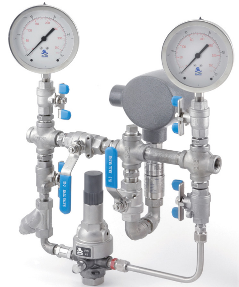
AMD-75 with PSL and PI (see options) (for illustration only)