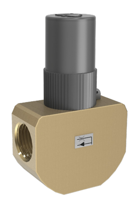
Nickel Aluminum Bronze