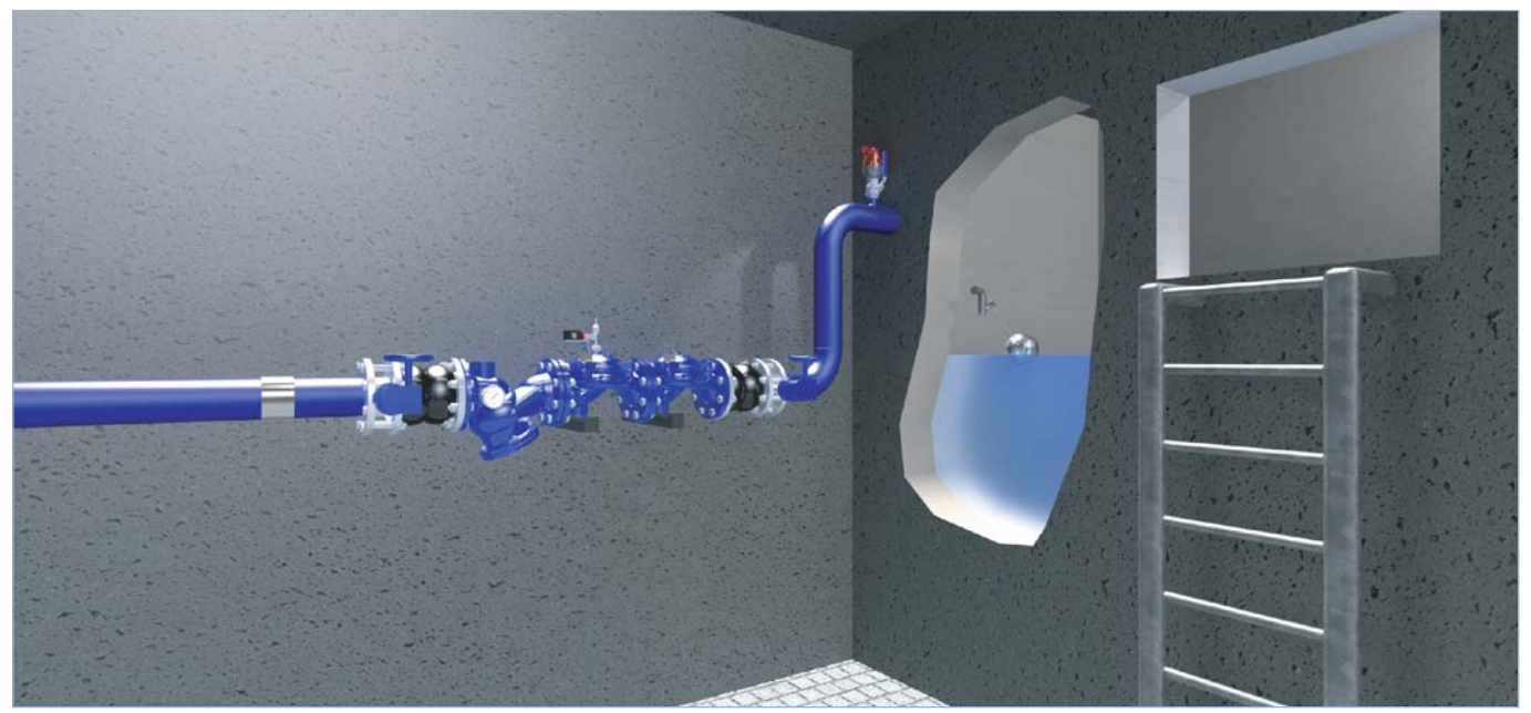
For illustration only