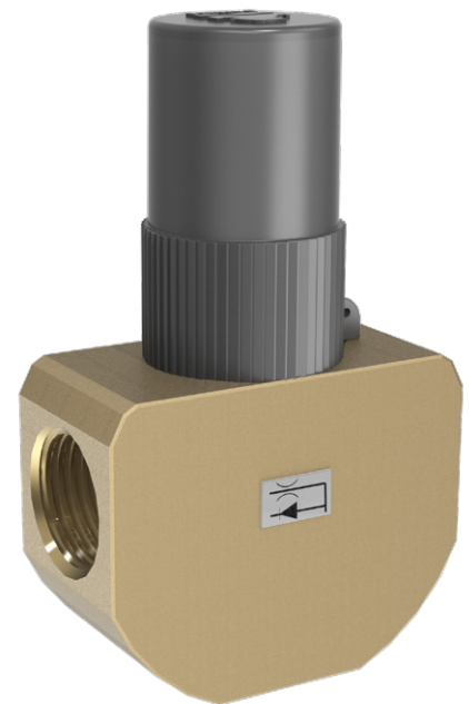
Nickel Aluminum Bronze