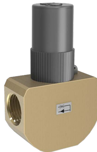
Nickel Aluminum Bronze