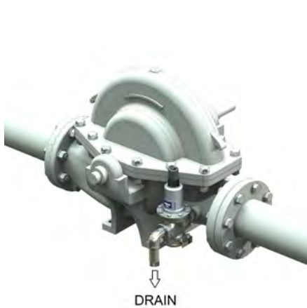
Fire pump casing relief valve for overheating prevention