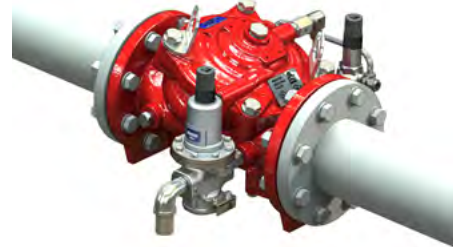
Pressure relief downstream of pressure control / reducing valves