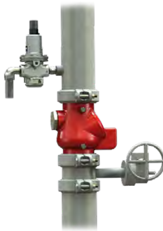
Sprinkler safety relief valve for wet pipe systems