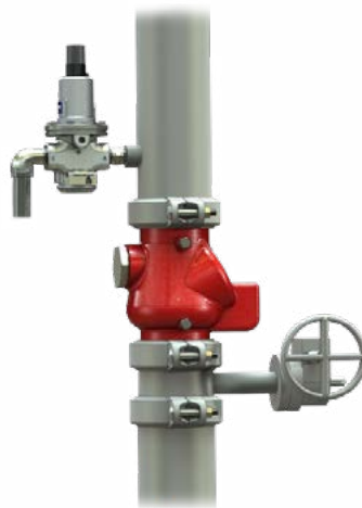
Sprinkler safety relief valve for wet pipe systems