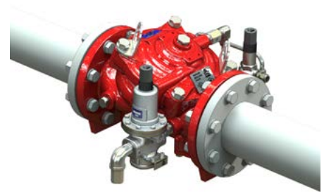
Pressure relief downstream of pressure control / reducing valves