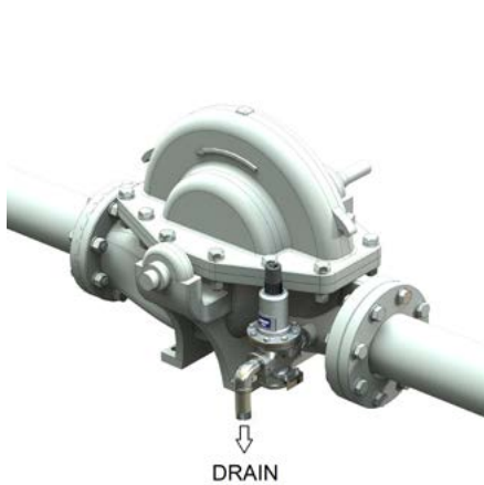
Fire pump casing relief valve for overheating prevention